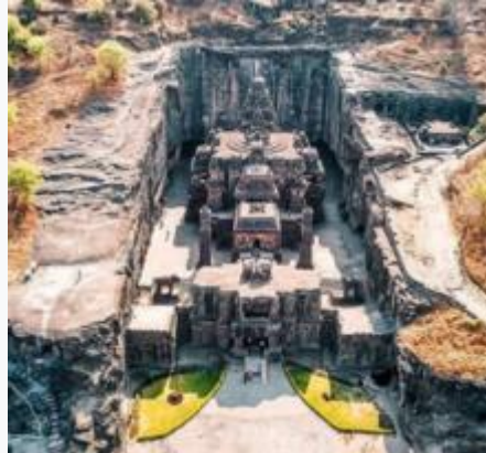
Aerial view of Kailasa Temple